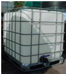
1000 Lt IBC Container

A 1000lt IBC container or 205lt drum as featured below can be located next to your ST Series Cold Pressure Washer and our engineer will connect to these.