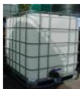
1000 Lt IBC Container

If you do wish to use a bulk tank as above then either a 1000lt IBC container or 205lt drum as featured below can be located next to your ST Series Hot Pressure Washer and our engineer will connect to these.