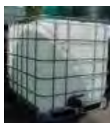
1000 Lt IBC Container

If you do wish to use a bulk tank as above then either a 1000lt IBC container or 205lt drum as featured below can be located next to your ST Series Hot Pressure Washer and our engineer will connect to these.